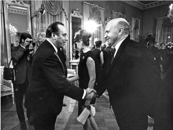
The Finnish foreign minister Väinö Leskinen and the Soviet diplomat Vladimir Semyonovich Semyonov shake hands at the SALT I negotiations in Helsinki. The negotiations lasted from 1969 to 1972.

After the US had proposed to the USSR to launch negotiations on the prohibition of ballistic missile defences in 1966, the Strategic Arms Limitation Talks (SALT) between the US and the USSR started in 1969 (Helsinki, Finland). Part of this first SALT process were formal negotiations of an ABM Treaty.