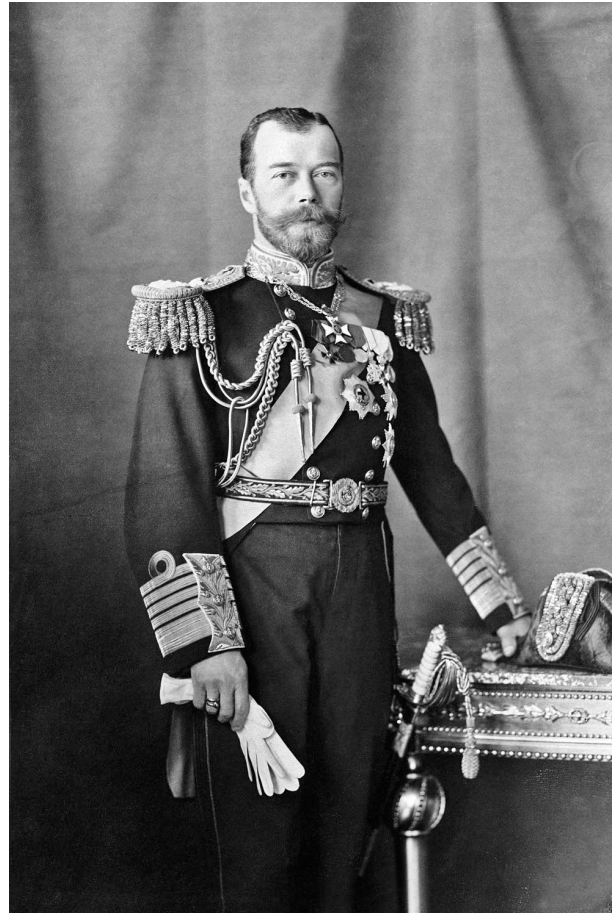
Tsar Nicholas II of Russia initiated the Hague Peace Conference of 1899.

The conference led to the signing of the Hague Convention of 1899. This Convention consisted of three main treaties and three additional declarations, which together established rules for declaring and conducting warfare as well as the use of modern weaponry and set up the Permanent Court of Arbitration