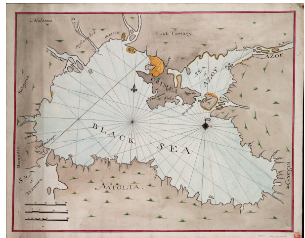
An early 19th century map of the Black Sea.

The treaty made the Black Sea neutral territory, closed it to all warships and prohibited fortifications and the presence of armaments on its shores.