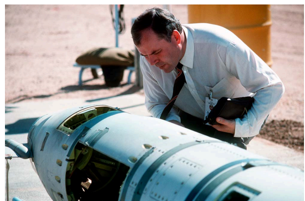
A Soviet inspector examines a BGM-109G Tomahawk ground launched cruise missile (GLCM) prior to its destruction.

In the second case, along with the Conventional Forces Europe Treaty (CFE; 1990) and the Vienna Document (VD; 1990, updated in 2011) , the Open Skies Treaty (OST, 1992) constituted a mutual reinforcing framework of arms control and confidence and security building measures (CSBMs) in Europe.