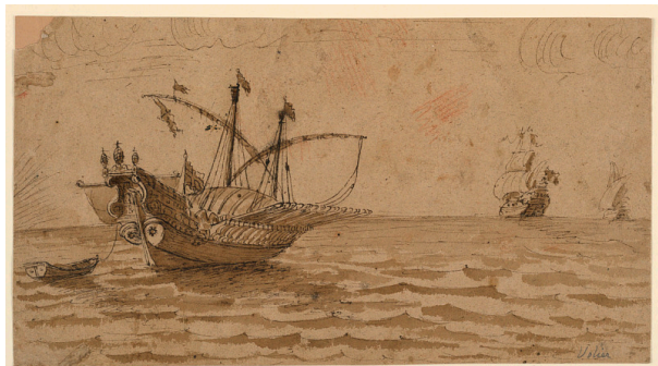
18th century war ships at sea.

Both states mutually declared that neither side would prepare any naval armaments beyond the peacetime establishment, both would limit their number of naval ships placed 'in the water,' and both would agree to provide preliminary notification if some different arrangement was found necessary.