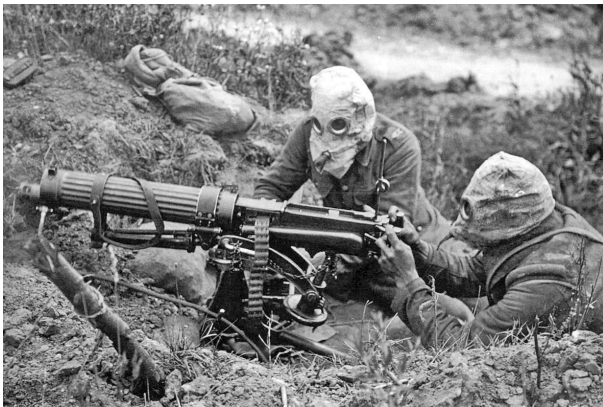
A British machine gun team wears anti-gas helmets in WWI.

ogical innovations in the field of infantry and artillery had been decisive factors in the outbreak and longevity of hostilities.