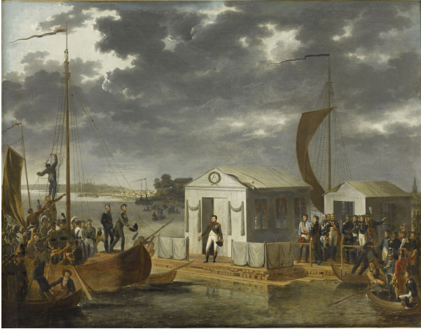
Meeting of the Napoleon I of France and Alexander I of Russia in a pavilion set up on a raft in the middle of the Neman River.

In 1808, two Franco-Prussian Treaties (also known as the Treaties of Tilsit) were signed, by which the Prussian army was limited to 42,000 troops for a period of 10 years from 1 January 1809 and Prussia was stripped of about half its territory.