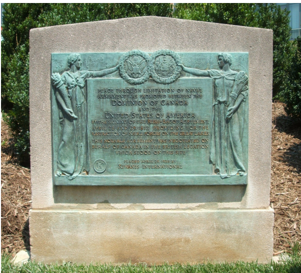
Historical marker for the Rush-Bagot Treaty in Washington, D.C., where the Rush-Bagot Agreement was negotiated.