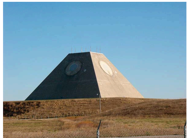
A Safeguard Missile Site Radar, built to defend US missile bases.