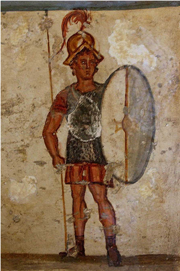
Fresco of an ancient Macedonian Greek heavy infantry soldier wearing mail armour, 3rd century BC.