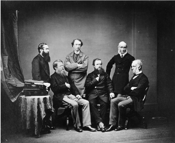
The British High Commissioners for the Treaty of Washington group for a picture.

The treaty between Great Britain and the US, leading to total demilitarisation and inaugurating permanent peaceful relations between the US and Canada, and the US and Britain.